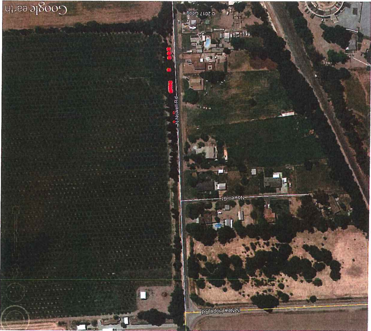
R-515- Location of all San Joaquin County tree removals