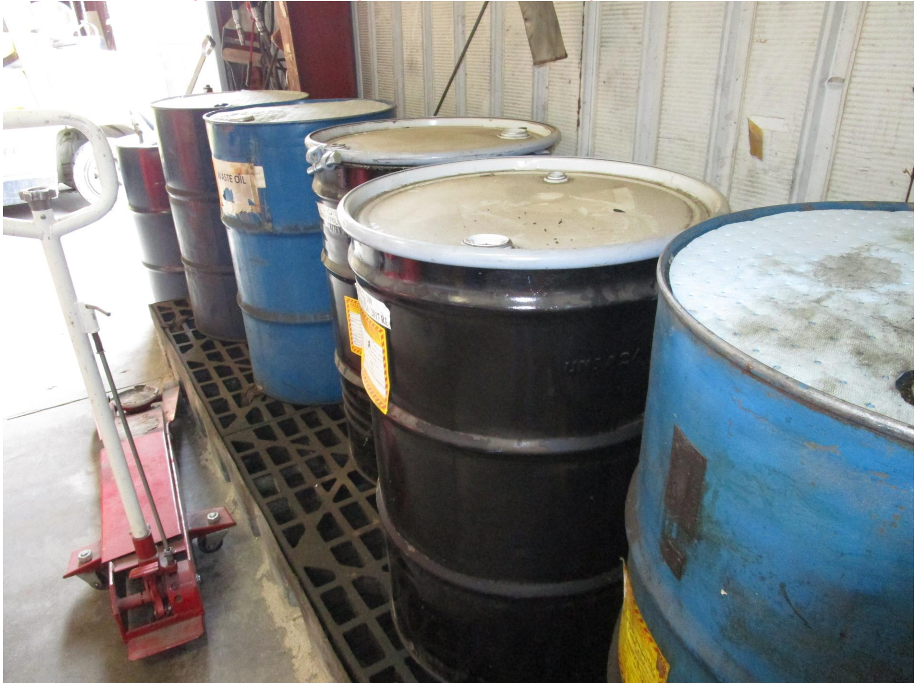
Photo 1: Hazardous waste storage area overview; three 55-gallon drums with used oil and two 55-gallon drums with waste solids.