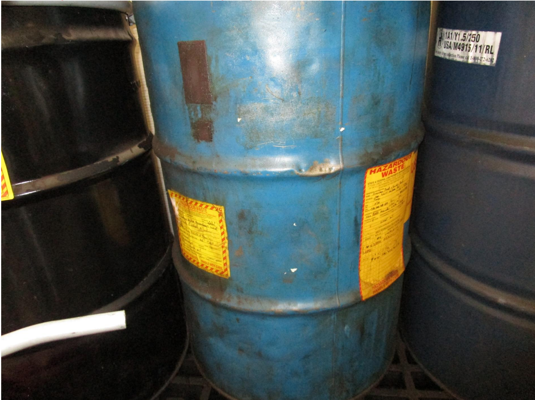
Photo 9: One 55-gallon drum with used oil observed with storage time greater than 180 days.