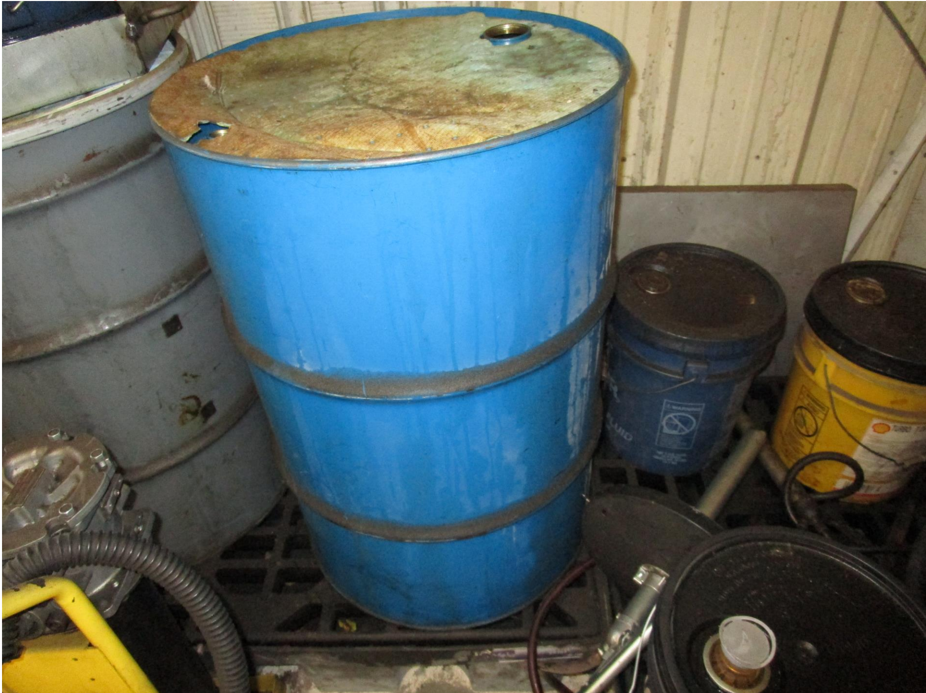
Photo 11: One 55-gallon drum partially full with used oil observed with no hazardous waste label and no lid.