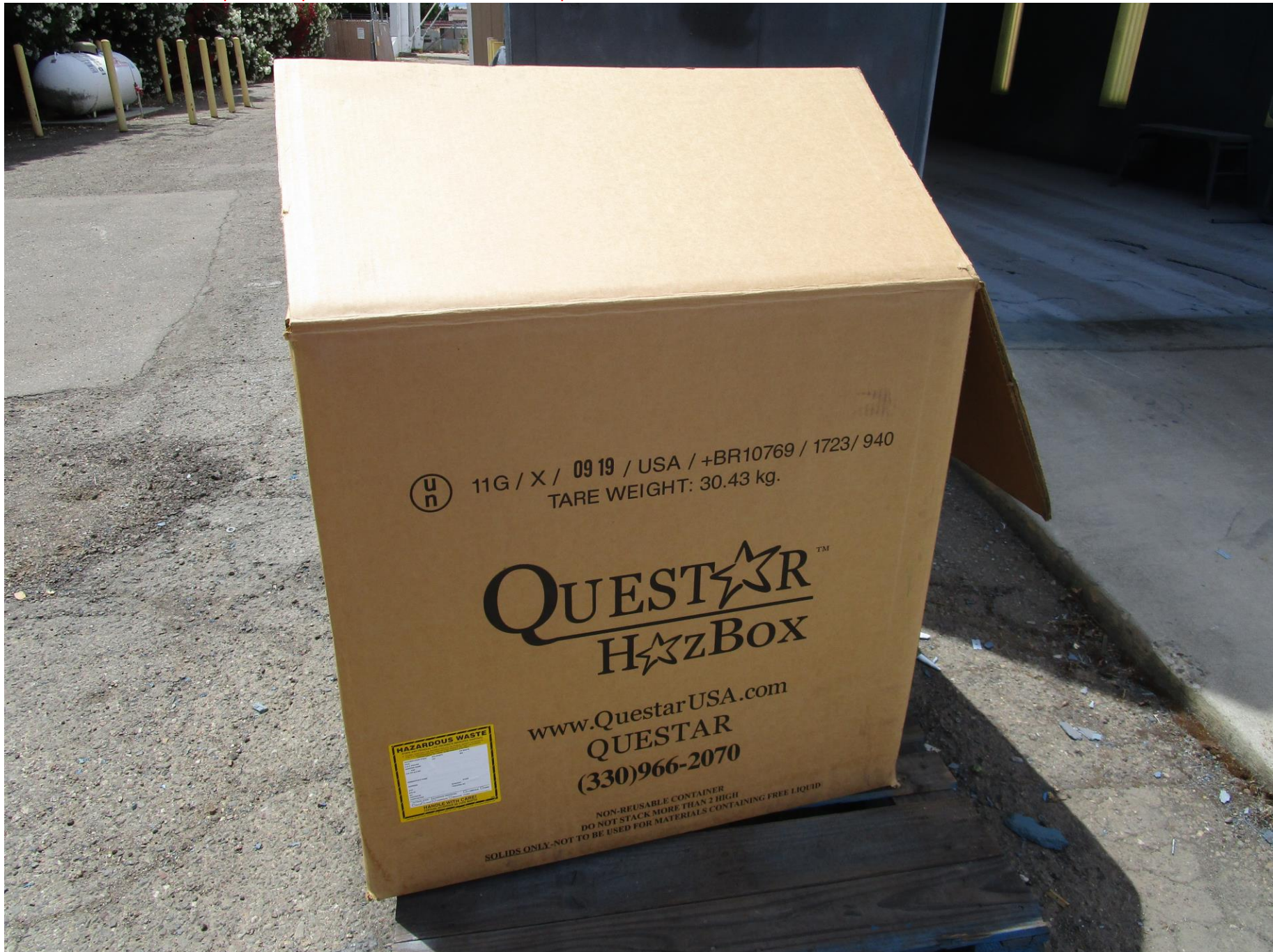
Photo 13: One approximately 2 by 2 foot box with used paint booth filters observed with no physical state, no hazardous properties, and no accumulation start date; operator opened and closed box while inspector was on site.