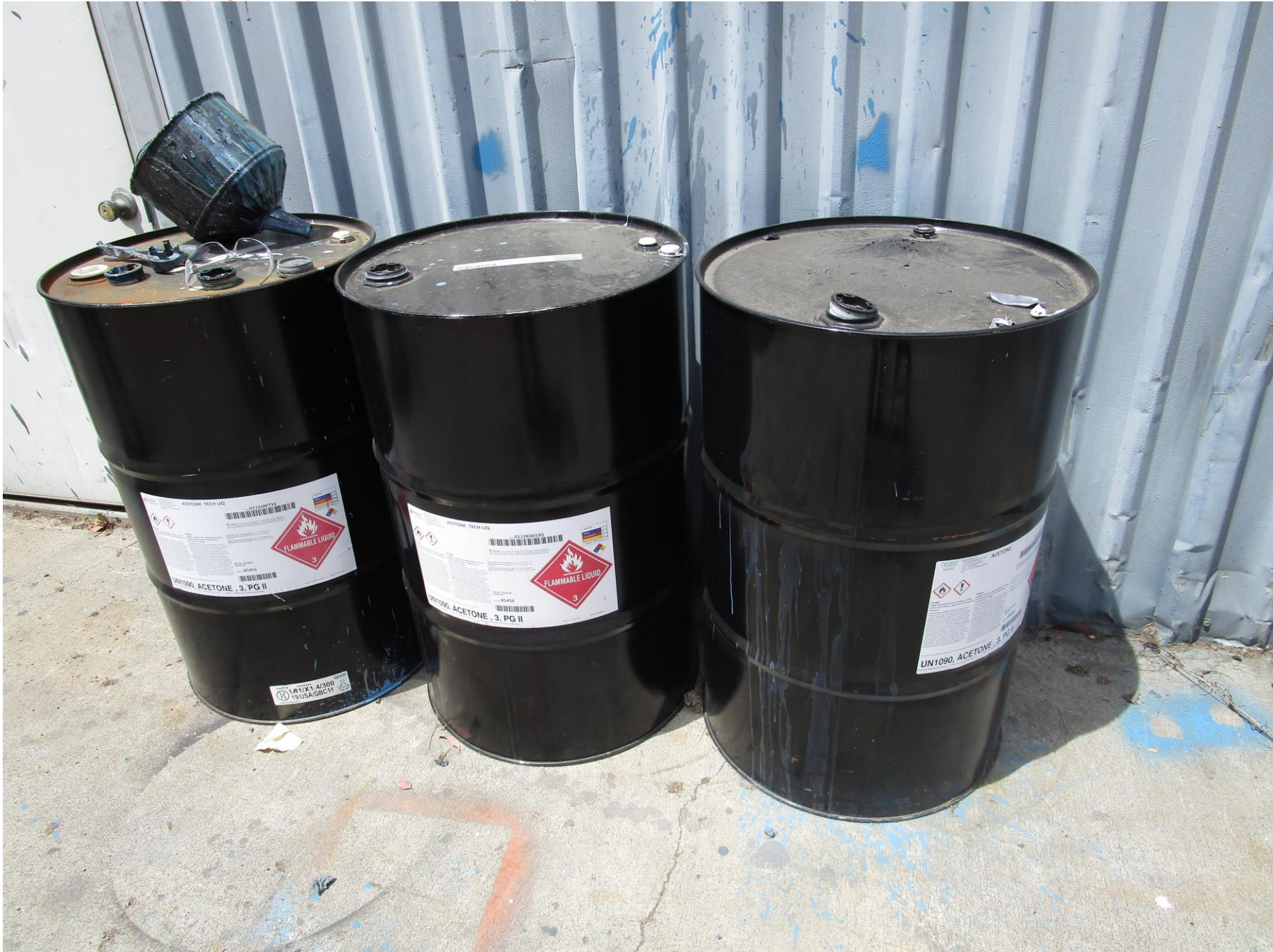
Photo 16: Three empty 55-gallon drums observed with no empty date.