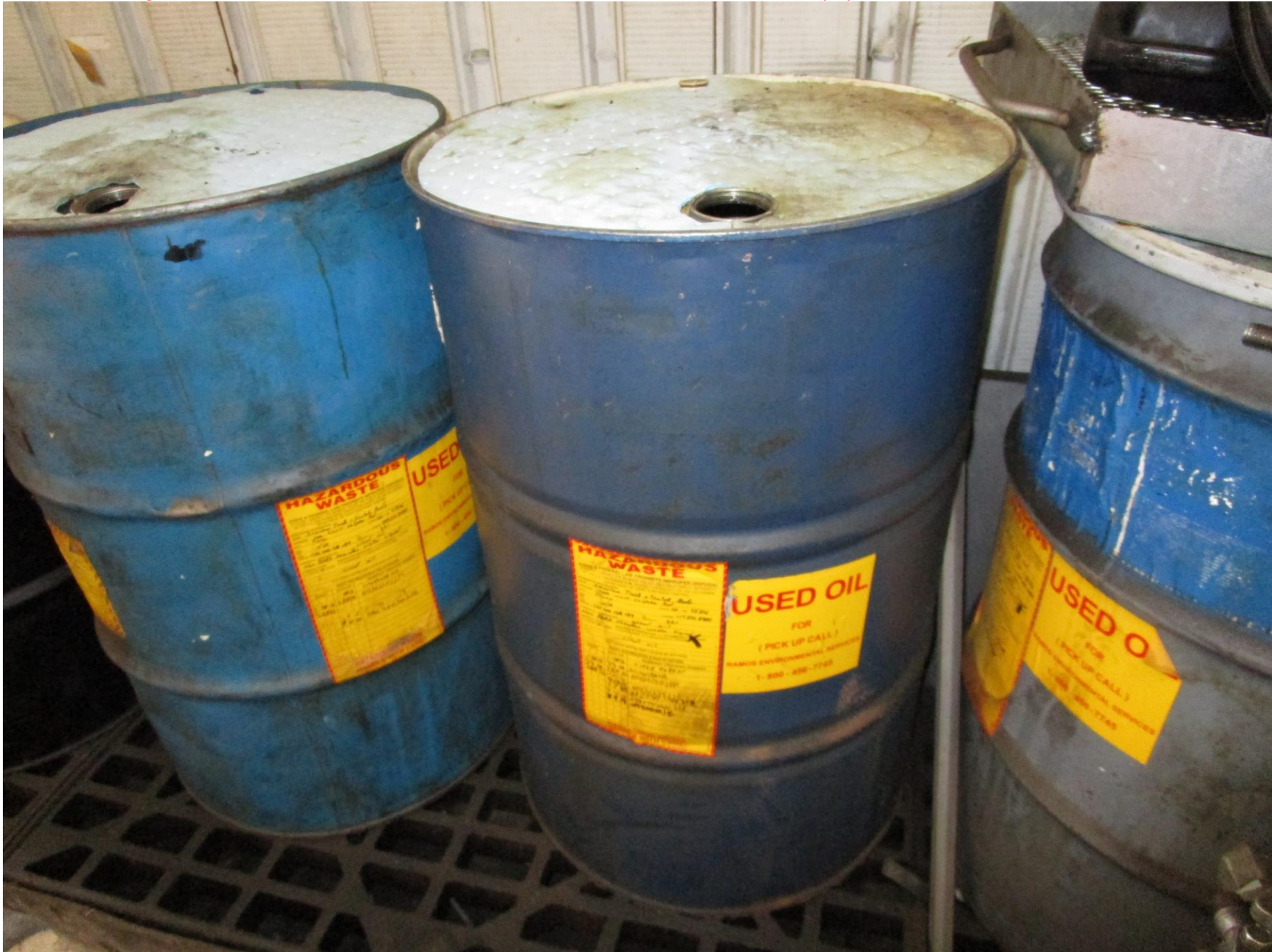
Photo 4: Two 55-gallon drums with used oil observed in non-secure containers; corrected on site by operator.